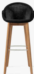
EDGARD BAR STOOL TEAK BASE