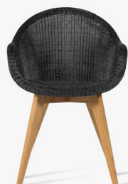
EDGARD DINING CHAIR TEAK BASE