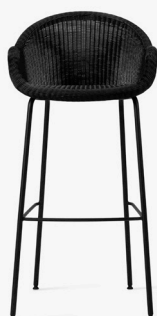
EDGARD BAR STOOL STEEL BASE