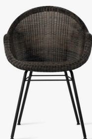
EDGARD DINING CHAIR STEEL A BASE