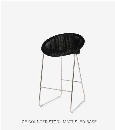
JOE COUNTER STOOL MATT SLED BASE