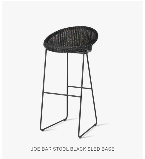
JOE BAR STOOL BLACK SLED BASE