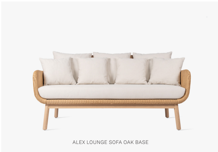
ALEX LOUNGE SOFA OAK BASE