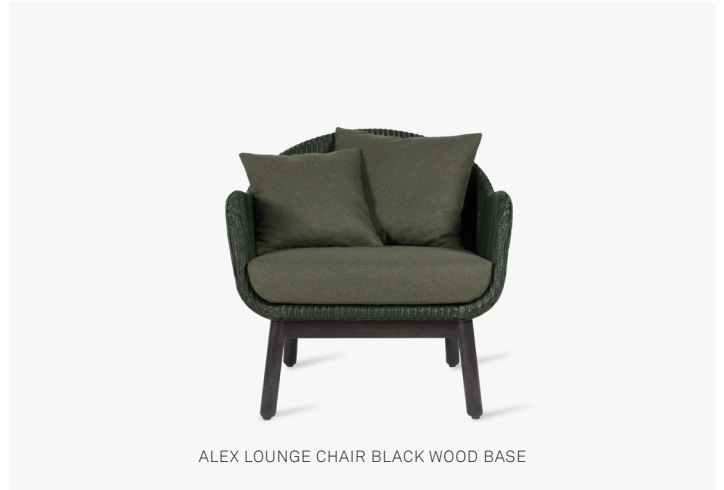
ALEX LOUNGE CHAIR BLACK WOOD BASE