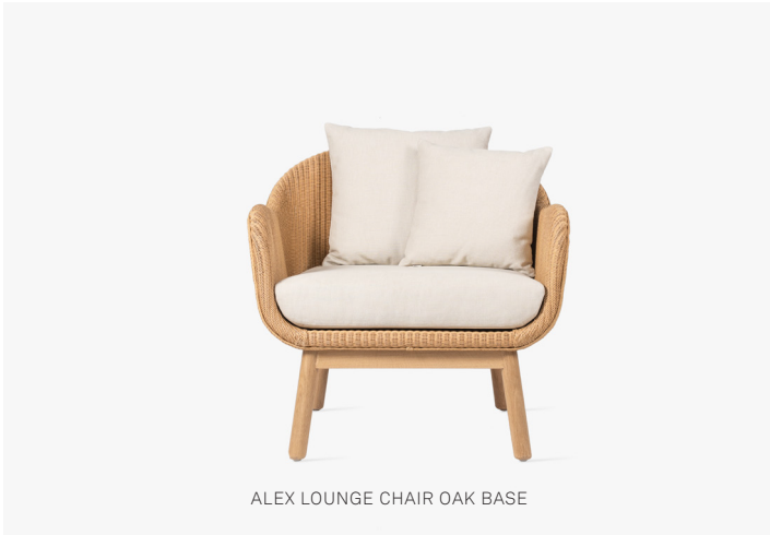
ALEX LOUNGE CHAIR OAK BASE