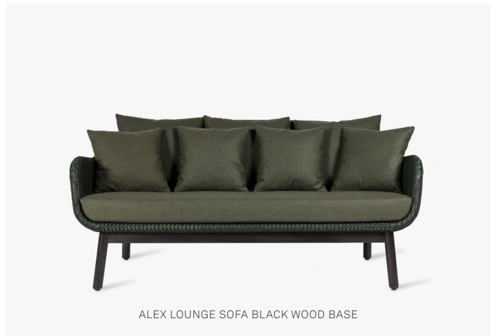
ALEX LOUNGE SOFA BLACK WOOD BASE