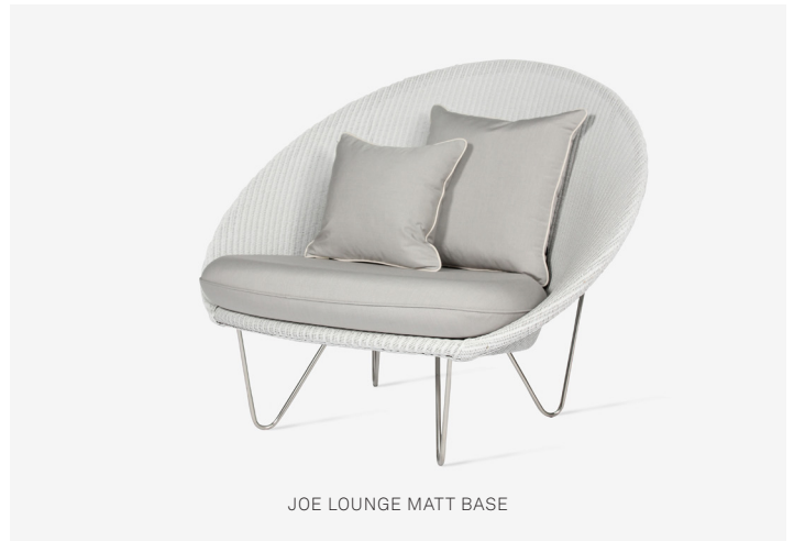
JOE LOUNGE MATT BASE