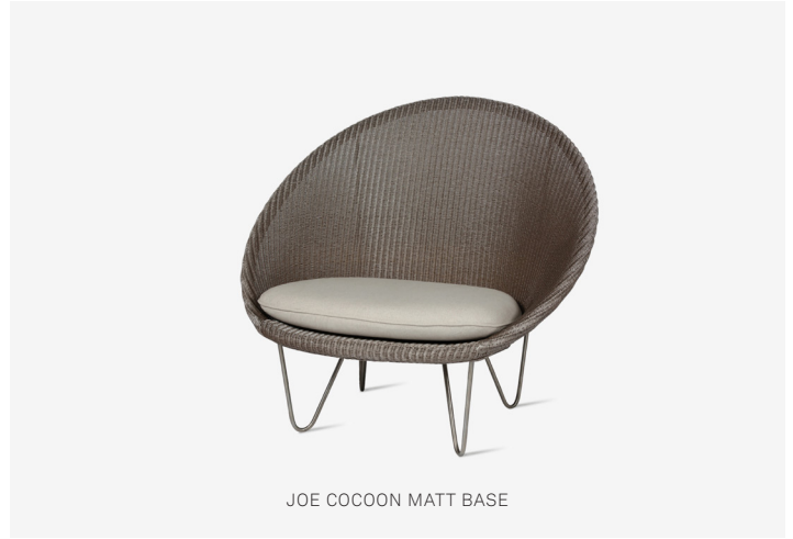
JOE COCOON MATT BASE