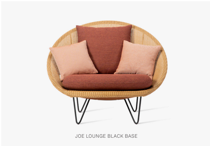
JOE LOUNGE BLACK BASE