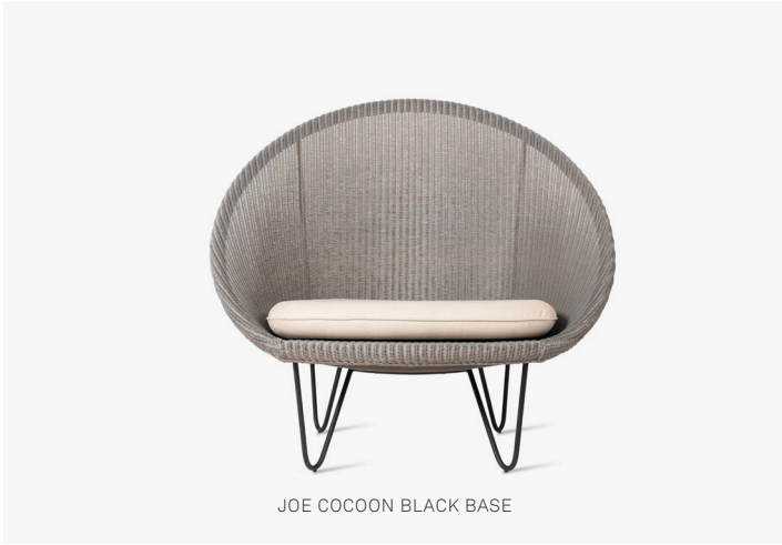
JOE COCOON BLACK BASE